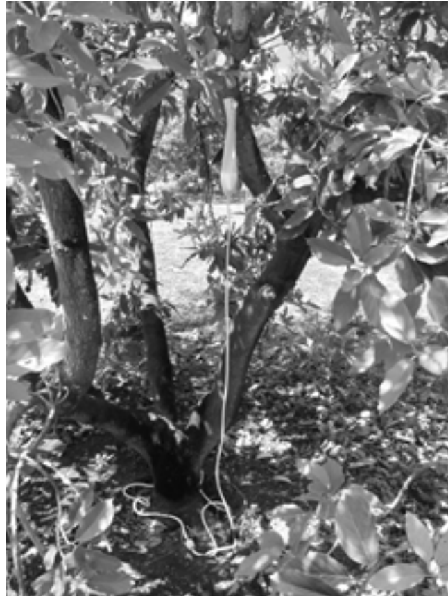
Fig. 2. Passive infusion of a mixture of Tilt® and water through ports inserted into flare roots and/or the base of the tree.